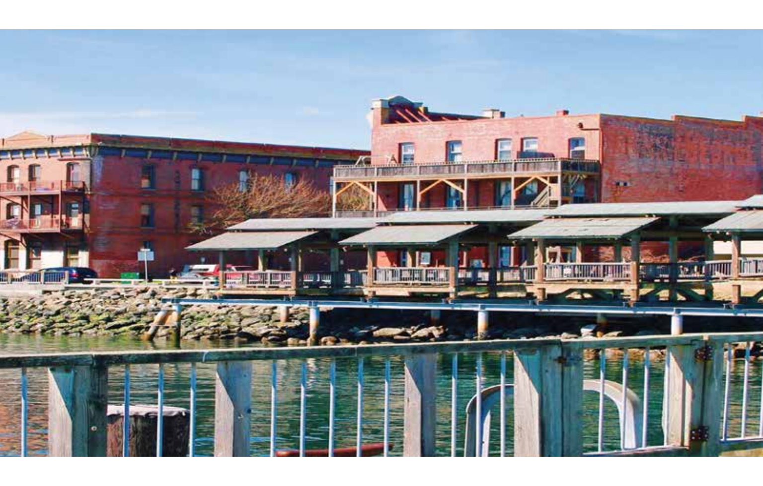
WATERFRONT IN PORT TOWNSEND - Victoria Baker