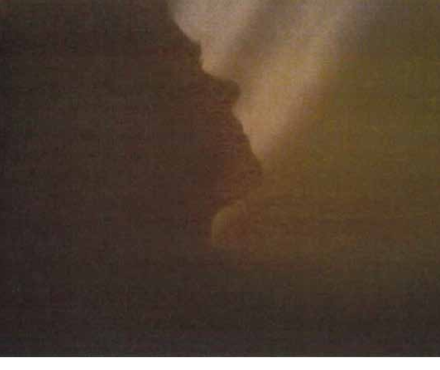
INTROSPECTION – Suzie Holly