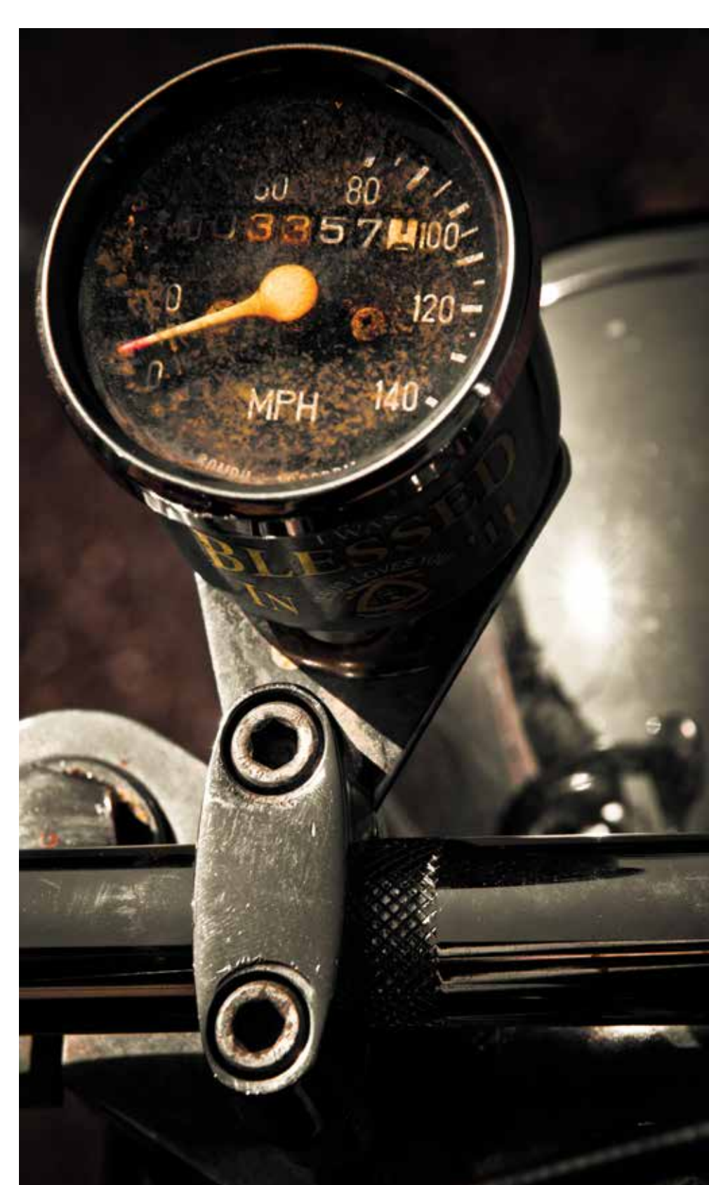
CHROME AND RUST - Gary Queens