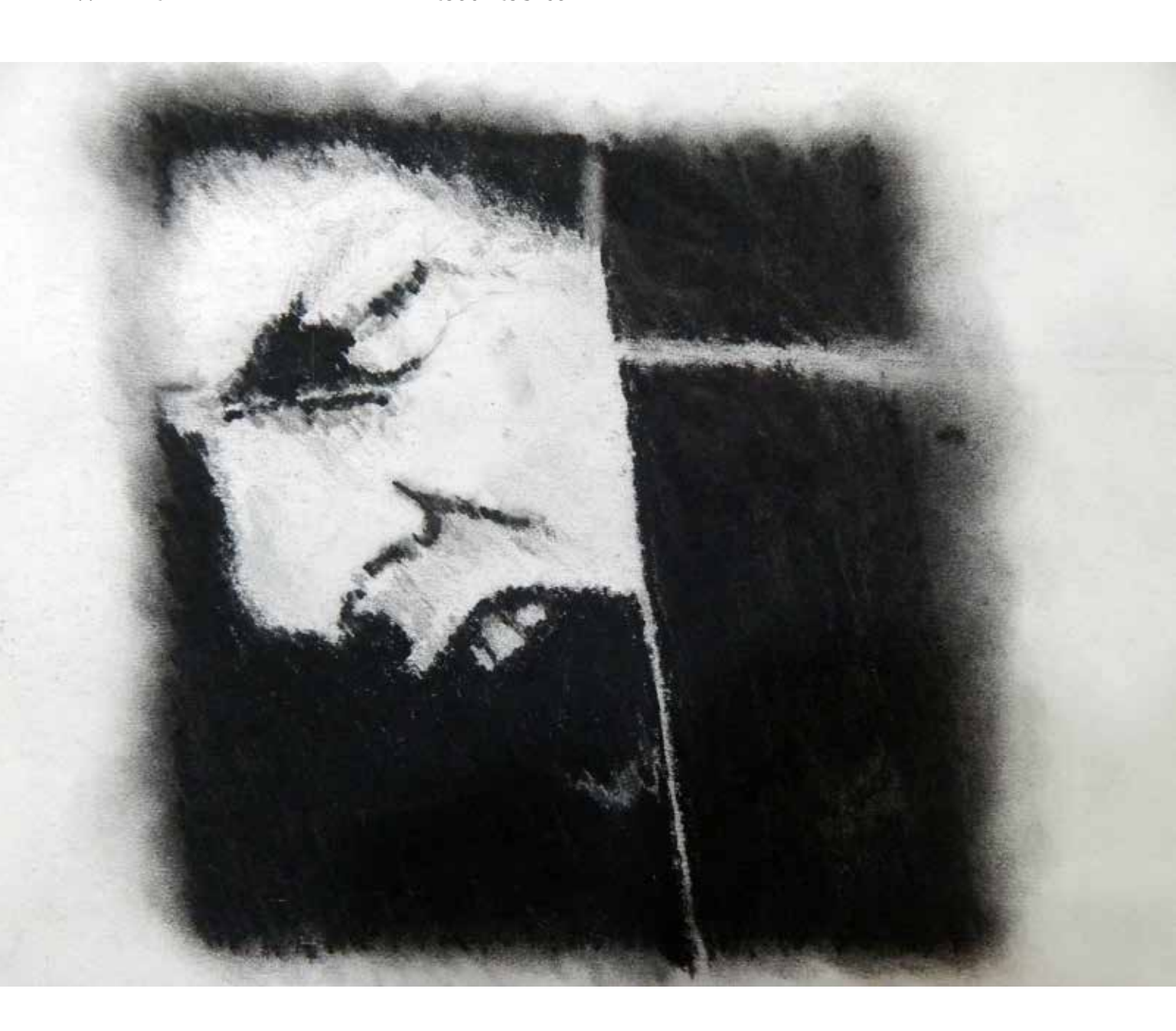
WE ARE A BATTLEFIELD – Rose Robles